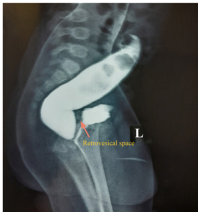
Figure 1 Distal loopogram showing retrovesical space.

then separated from the urethra under direct vision (figure 2C). The urethra was closed with a 2/3 interrupted suture. The rectum was then mobilized enough to bring it to the perineum within the sphincter complex without undue tension. After the anoplasty, the wound was closed in layers. A Foley catheter was kept in the bladder for 24 hours. The patients were discharged home on the third or fourth postoperative day and advised to follow-up after 15 days. On follow-up, the caliber of the neoanus was checked. When adequate, parents were advised for colostomy closure after 3 months, and when not acceptable, parents were advised to consider dilation with a Hegars dilator followed by colostomy closure.