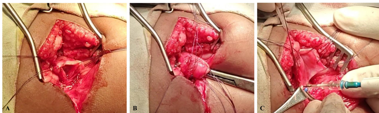
Figure 2 Surgical technique. (A) opening the rectal pouch in the midline; (B) proximal mobilization of the rectum and dissection of the retrovesical space with a Moynihan forcep; (C) proximal mobilization of the rectum and dissection of the retrovesical space with a Moynihan forcep.

Over 80% of boys with ARM have RUF, which is a major challenge for surgeons due to the shared wall between the rectum and urethra, resulting in frequent injury-related urethral complications during PSARP. 5-7 However, modifications to the original PSARP have been reported to reduce urinary injury and complications. For example, Huang et al suggested performing cystoscopy before PSARP to place a ureteral catheter through the fistula into the rectum. 7 Stenström et al placed an endoscopy-guided guide wire through the stoma into the fistula. 8 These procedures make it easier to identify fistulas and reduce urethral complications. Nevertheless, they require an extra procedure, increased operation time, and longer anesthesia and pose a risk of contamination. Moreover, these modifications do not reduce the risk of urethral injury during fistula resection. It is not