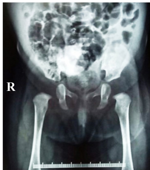
Figure 2 Cystogram (radiograph of the bladder with contrast, not properly visualized as not holding the contrast). R, right.

Rare variants of bladder exstrophy are pseudo-exstrophy, covered exstrophy, duplicate exstrophy, superior vesical fissure, visceral sequestration, and omphalocele, exstrophy of the cloaca, imperforate anus, and spinal defects syndrome. They comprise 10% of all cases of the exstrophy-epispadias complex. 1 Here, we managed a 1-year-old male child who presented with a 2.5 cm diameter mucosal opening in the hypogastric region, draining urine through it. The child also had distal penile hypospadias with a stenotic meatus through which he passed urine. The prepuce was hooded, and there was no chordee. On inserting a small-caliber feeding tube through the stenotic meatus, it is visible through the hypogastric region defect. A low-lying umbilicus was present (figure 1A,B). Widening of the symphysis pubis both clinically and on an X-ray was present. There was a divergence of the rectus abdominis muscle. Both testes were in the scrotum. He was continent of urine. Blood investigations were normal, including