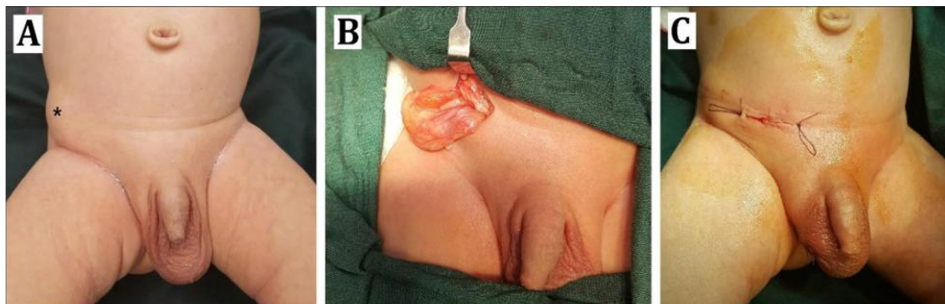
Figure 1 (A) Ectopic right testis in anterior abdominal wall near anterior superior iliac spine. (B) Delivery of ectopic testis via inguinal incision. (C) Right orchiopexy with closure of inguinal wound.

in 1% of all instances of undescended testes and the first case was reported in 1786 by John Hunter. 7 TTE 'crossed ectopic testis or testicular pseudo-duplication' is a condition when the two testes slip through the same inguinal canal and situated in one hemiscrotum, or sometimes the patient presents with unilateral non-palpable testis and contralateral inguinal hernia in which both testes are in one hernial sac, 8,9 and usually the diagnosis in such case is made intraoperative. The other rare sites of ectopic testis like the femoral canal, prepenile and retro vesical ectopic testis have also been reported. 2